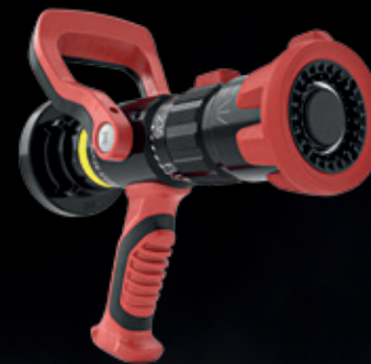
TURBO-SPRITZE EVO 235