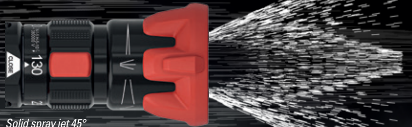
Solid spray jet 45°