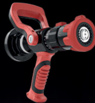
TURBO-SPRITZE EVO 130